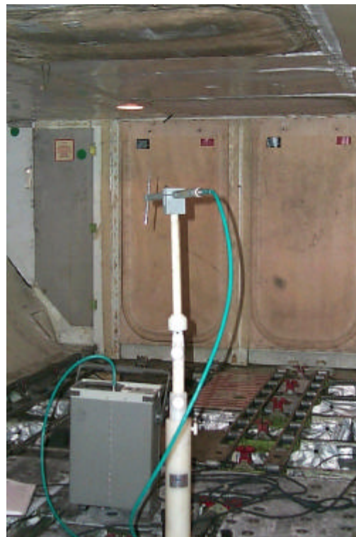
Measuring aft of Avionics Rack