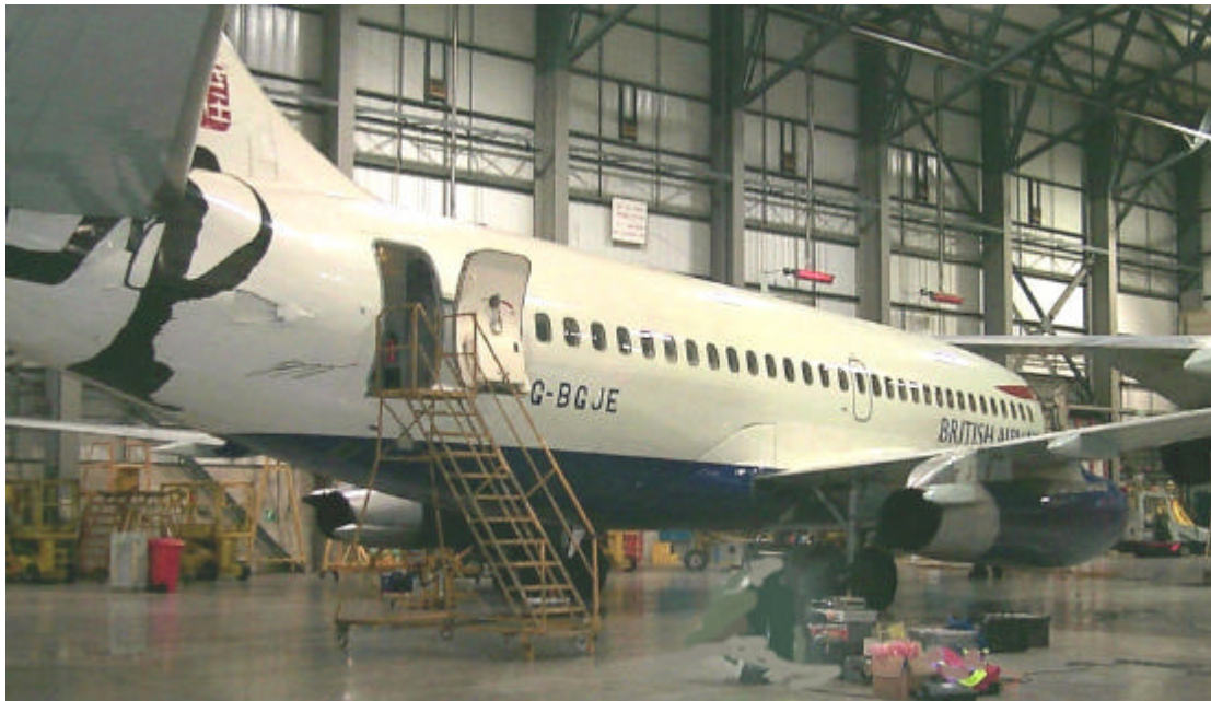
British Airways Boeing 737-236 in Gatwick Hangar