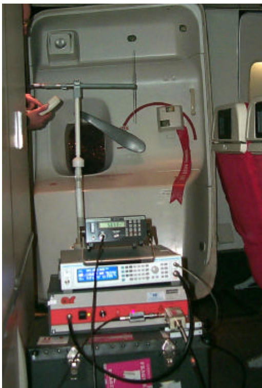
Transmitting from Rear Cabin