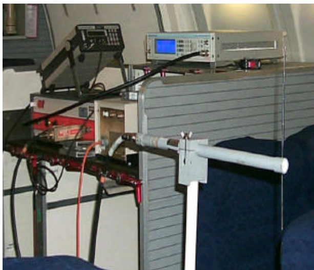
Transmitting from Rear Cabin