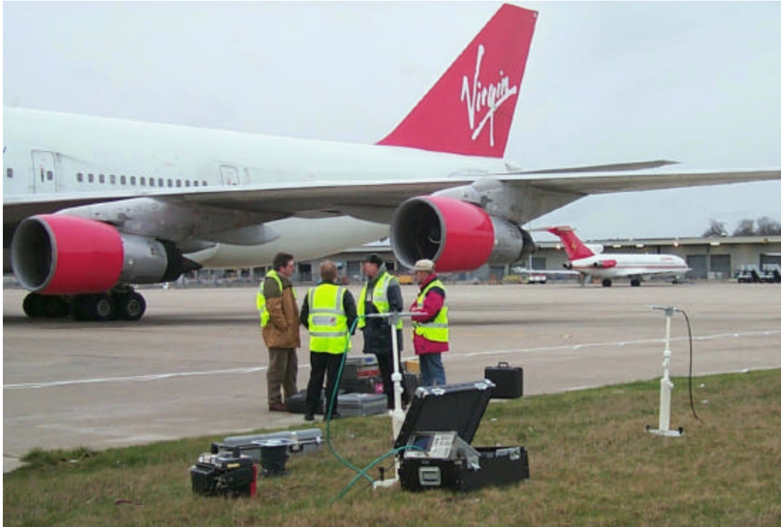
Measuring Equipment Calibration Check Adjacent to Virgin Atlantic Boeing 747