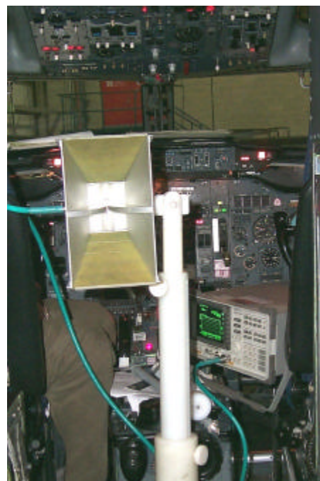
Horn Antenna on Flight Deck